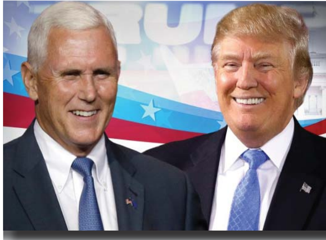
Donald Trump & Mike Pence for President & Vice President