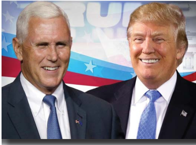
Donald Trump & Mike Pence for President & Vice President