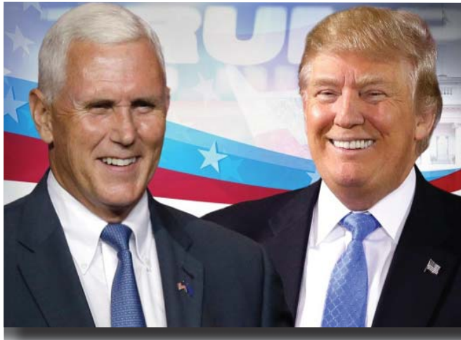
Donald Trump & Mike Pence for President & Vice President